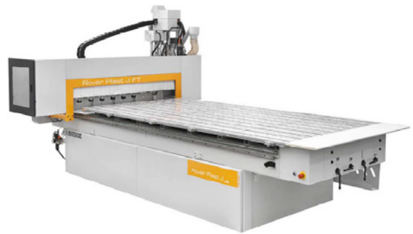
Rover Plast J FT 1530