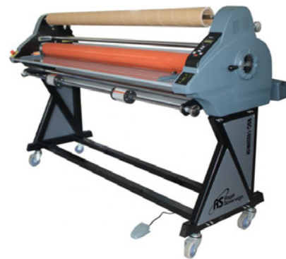
Royal Sovereign RSC-1402CW Cold Roll Laminator