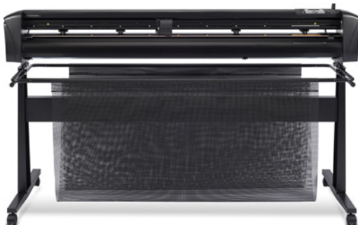
HP Latex 64 Cutter