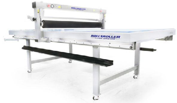
RollsRoller Flatbed Applicator