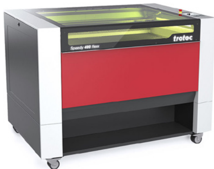
Trotec Speedy 400 Laser Engraver