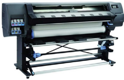
HP Latex 335 Printer